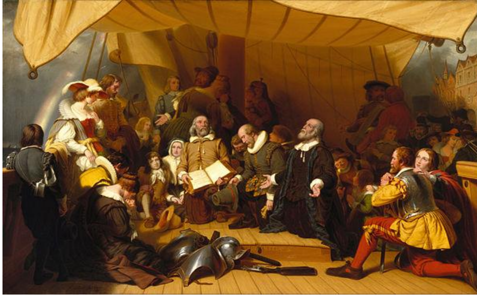
The Embarkation of the Pilgrims (1857) by Robert Walter Weir

These pilgrims were led by God to escape persecution, forsaking familiarity for faith. Their obedience shaped a nation that, for generations, became known as a refuge for conscience and worship.